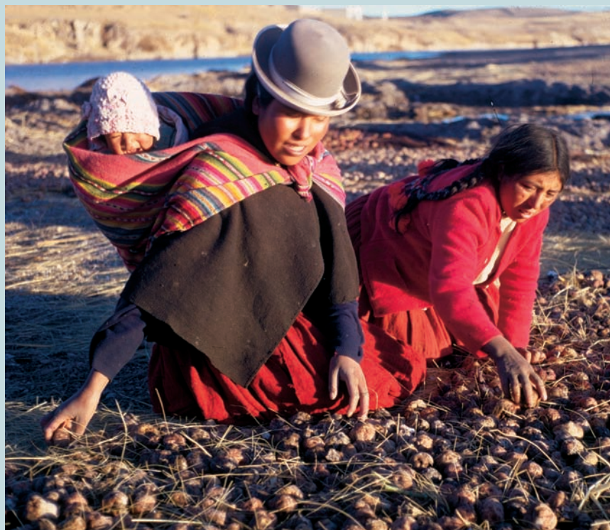
FIGURE 4 Women farmers are key players in ensuring food security.

nerships are strengthened by the utilization of user-friendly decision-support tools and methods, and participatory approaches. CIP and its partners are confident that the approaches and methods proposed in ALTAGRO will help to achieve the MDGs, as they have already been tested in previous projects implemented in 8 peasant communities in the Peruvian Altiplano. ALTAGRO will build on the results of these projects and partnerships to construct a model for the achievement of the MDGs in poor mountainous areas.