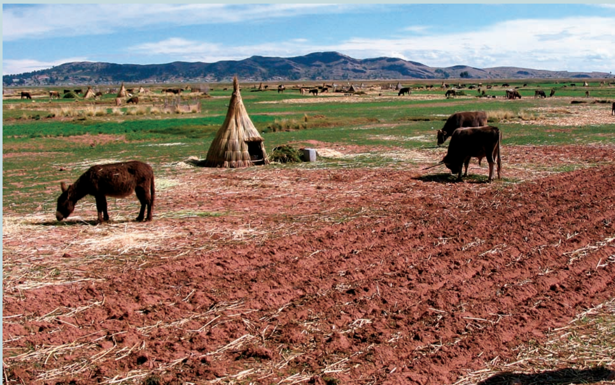
FIGURE 1 The centuries-old land use system developed by the indigenous communities on the Altiplano combines crop and livestock production.

During the last two decades, the International Potato Center (CIP) and its part-